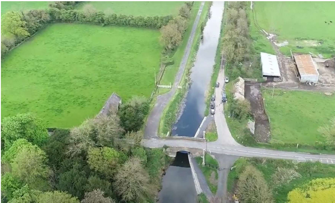
Access Reopened Under Ponsonby