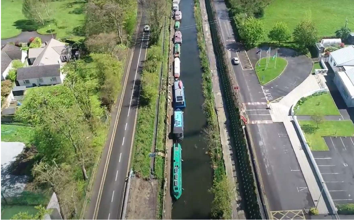
Soil Nailing/Hydroseeding along Church Rd