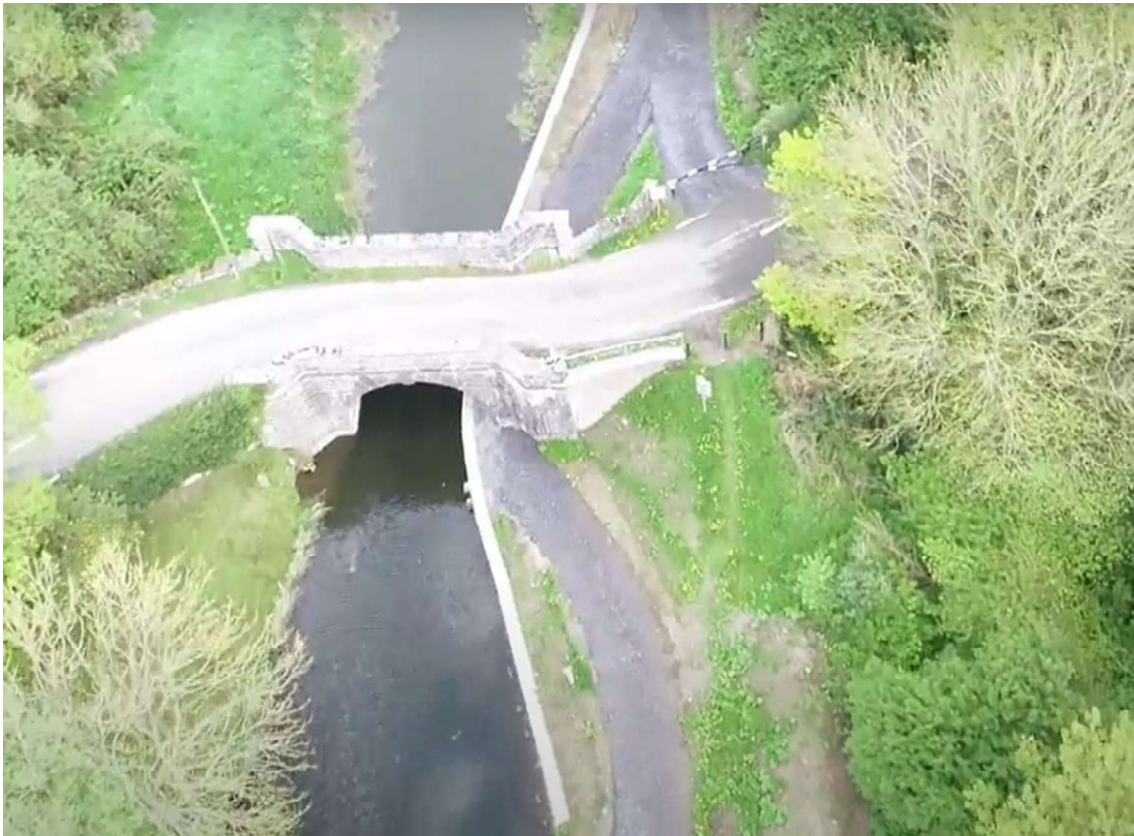
Underbridge Access Reopened at Devonshire