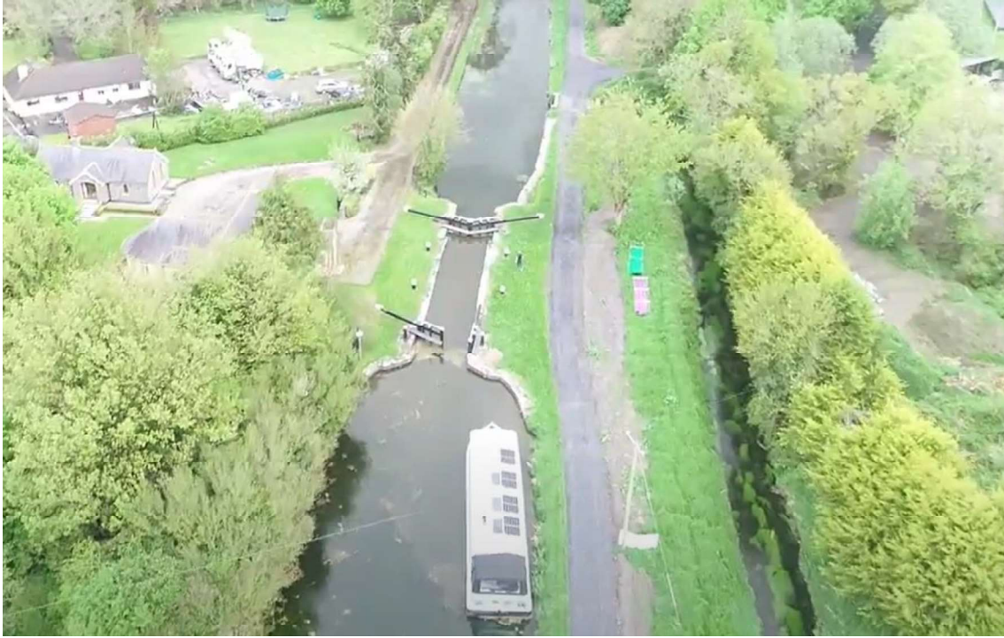
Works at Lock 15