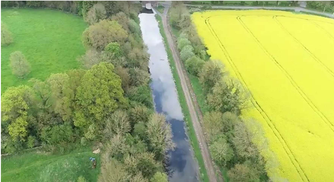
Greenway Complete to Capping between Devonshire & Ponsonby