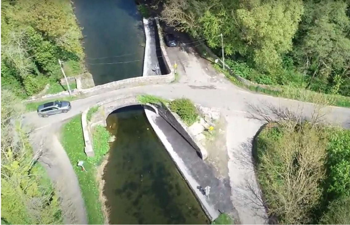
Access Reopened under Henry Bridge